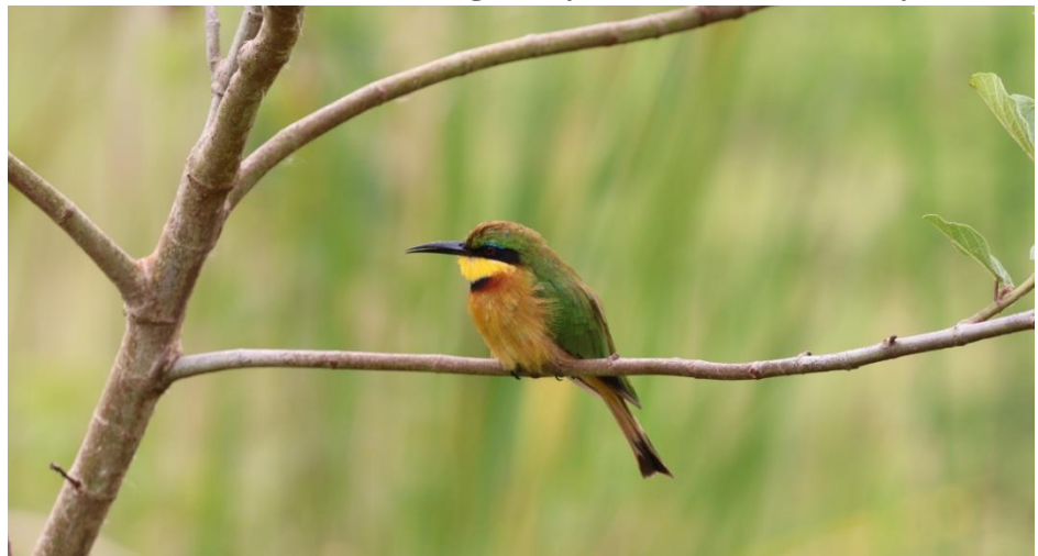
Picture 8: Little bee-eater/ Nyandungu Urban Wetland Eco-tourism Park, Picture by Claudien

After a short break coffee at Bourbon Coffee inside the eco-park, we continued our birding and we have seen Black-headed Gonolek, Gray-backed Fiscal, Green-backed Camaroptera, Banded Martin, Common Bulbul (Dark-capped), the migrant Willow Warbler, Black-lored Babbler, African Thrush, Spotted Flycatcher, White-browed Robin-Chat, African Stonechat, Scarlet-chested, Bronze, Red-chested and Variable Sunbirds, Slender-billed, Holub's Golden-Weaver and Village Weavers, Red-billed Quelea, Southern Red Bishop, Fan-tailed Widowbird, Common Waxbill, Green-winged Pytilia, Pin-tailed Whydah, Yellow-fronted Canary and Western Citril. At 12pm, we drove at the Heaven Hotel, where the client spent the final night. In the green garden of the hotel an African Hobby was hanging on a top of a dead tree.