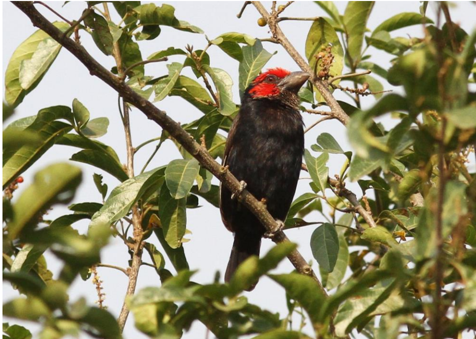
Picture 1: Red-faced Barbet ( Lybius rubricacies )/ Akagera National Park

Tour Guides: Claudien Nsabagasani and Claver Ntoyinkima